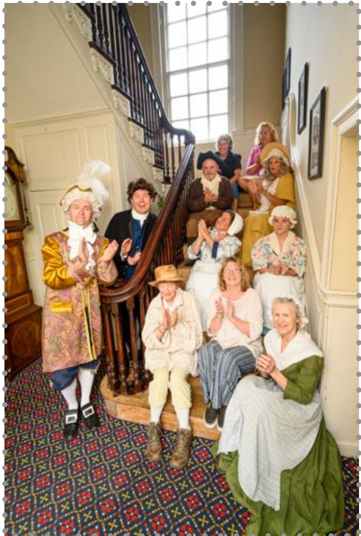
Blackadder Three Photoshoot at Wordsworth House and Gardens