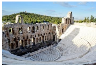
Theatre of Herodes Atticus, Athens