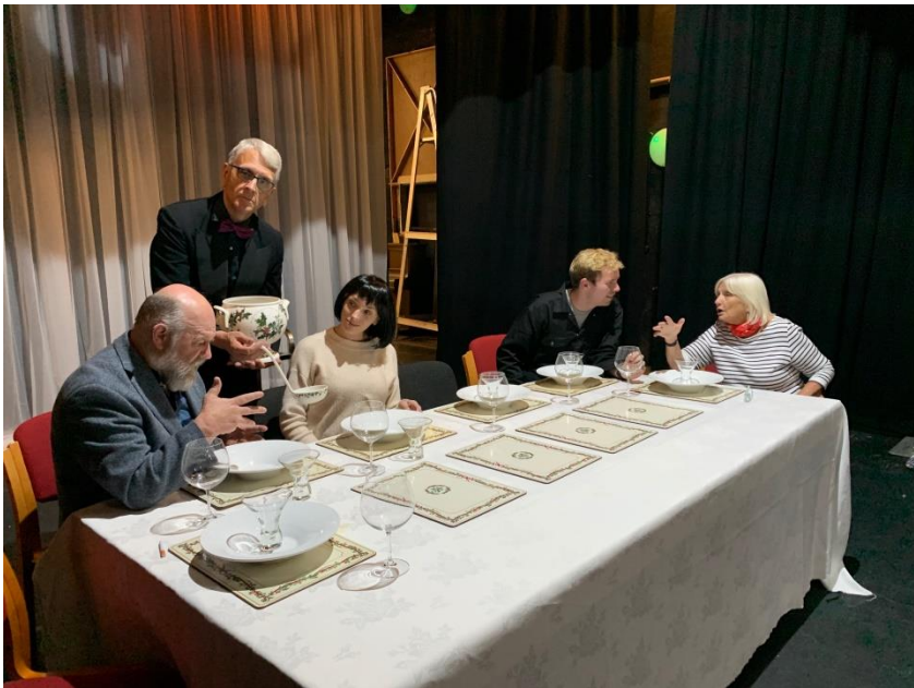
Cast rehearsal of 'Dinner'.