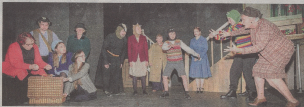
AUTHENTICITY: Goodnight Mister Tom is at the Theatre Royal from Tuesday

"Goodnight Mister Tom has only been on amateur release this year, after the pro-