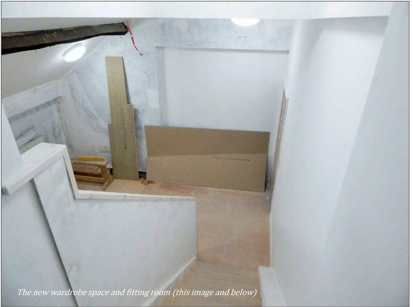
The new wardrobe space and fitting room (this image and below)