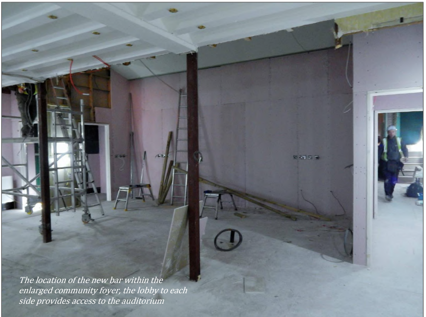
The location of the new bar within the enlarged community foyer, the lobby to each side provides access to the auditorium

Total spending to date amounts to £266,830 net of VAT, and the anticipated final contract sum stands at £431,538, which is an improvement of £1,115 over last month's figure. The completion date of 19 February remains unchanged.