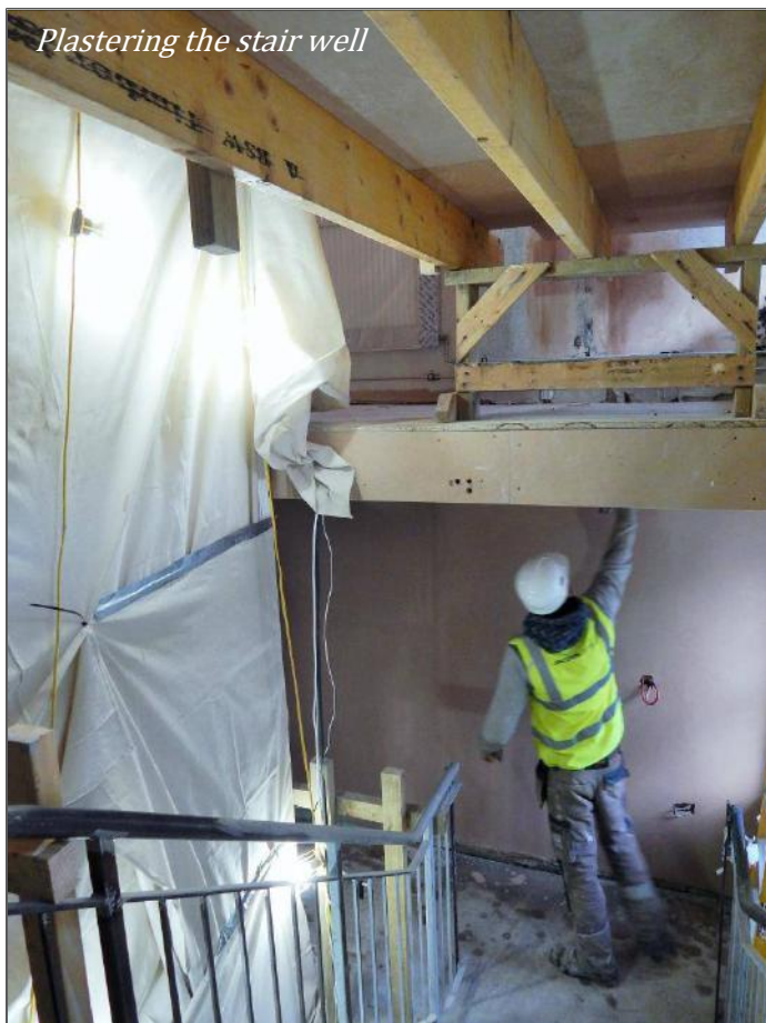
Plastering the stair well